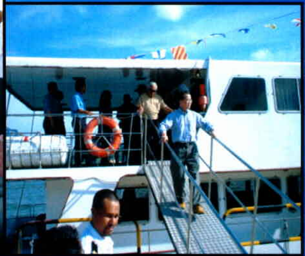
Delegates disembarking after the cruise.