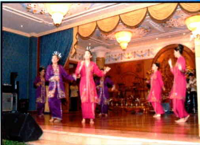
Brunei Cultural performance during Welcome Dinner.