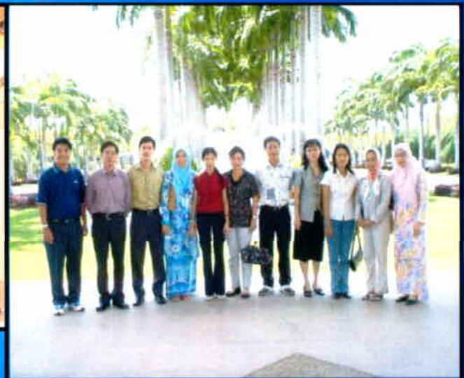
Delegates at Jame' Asr Mosque.