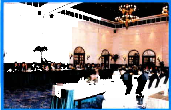
14th ASSA Board Meeting