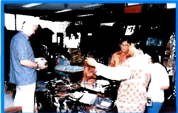
Visit to Batik painting