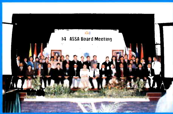
Group photograph of ASSA Delegates during Pre ASSA Meeting Seminar