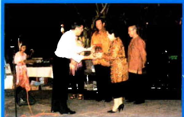
Farewell Dinner at Melia Purosani Hotel