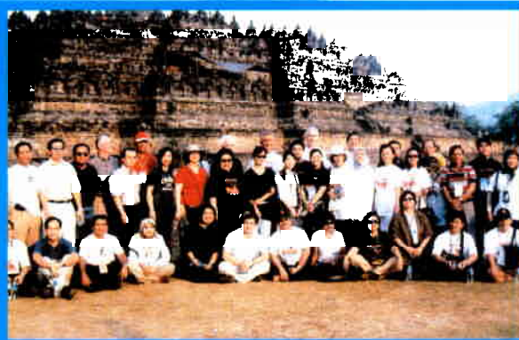
Visit to Borobudur Temple